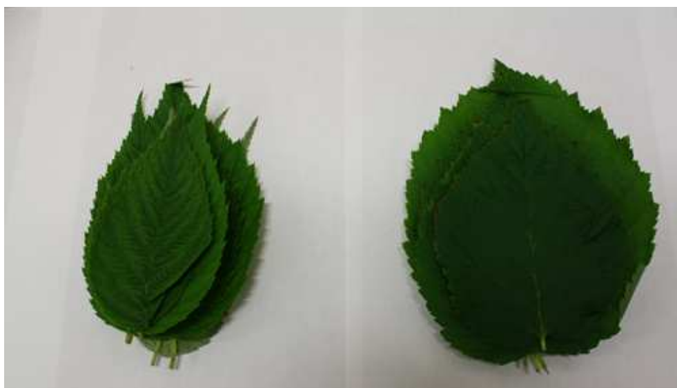
Pic. 3 Young leaf sample (left) and an old leaf sample (right)