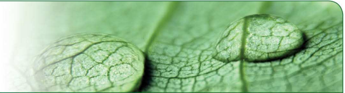
Pic. 2 Young leaves from the top of the plant